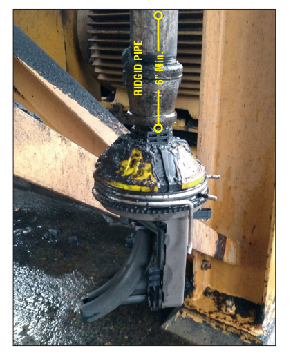
The R75M Debris Sweeping Sprinkler requires a ridgid inlet pipe, at least 6" long.