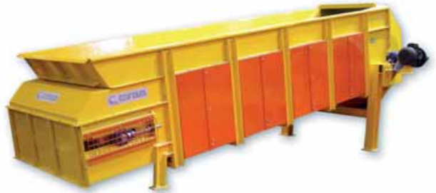
■ Mod. TAP