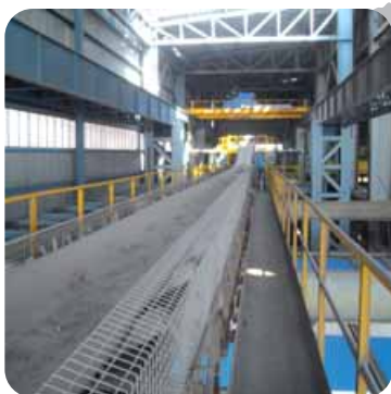
Metallurgy | USA