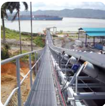
Aggregates | Panamá