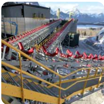
Cement | Canadá