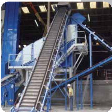
Chemical | Francia