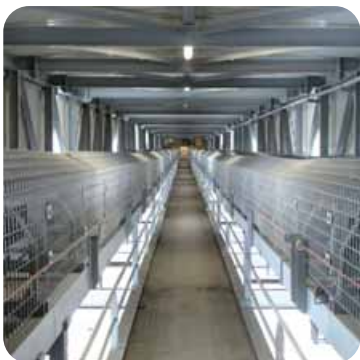
Cement | Bélgica