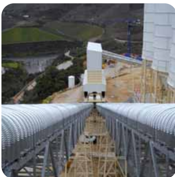
Civil work | Reino Unido