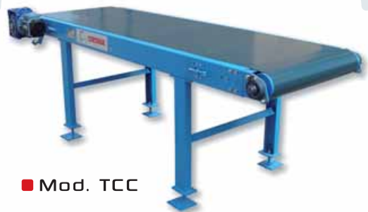
■ Mod. TCC