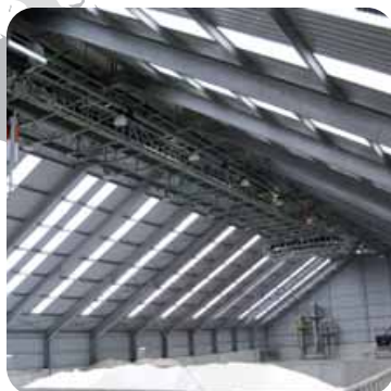
Farming | Italia