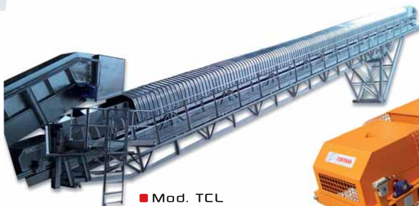
■ Mod. TCL