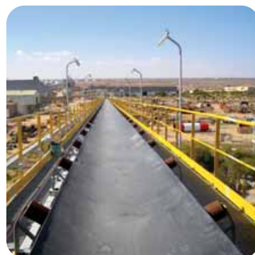
Energy | Qatar