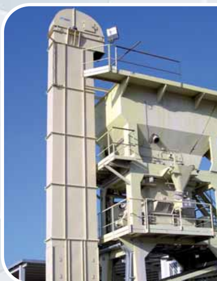
■ Mod. TEC