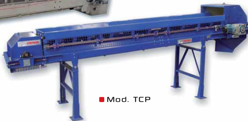
■ Mod. TCP