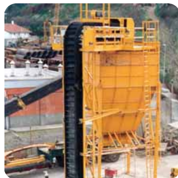
Civil work | Chile