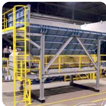
Mining | Arabia Saudi