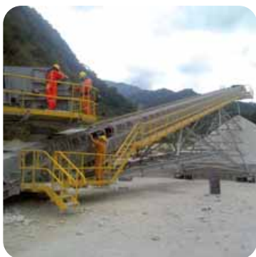
Mining | Ecuador