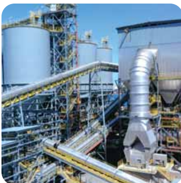
Cement | Australia