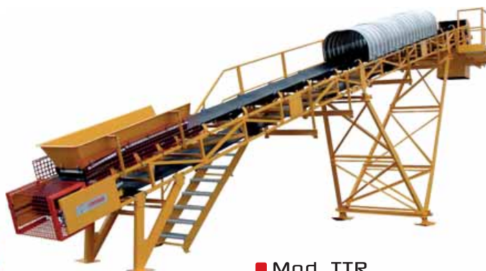
■ Mod. TTR