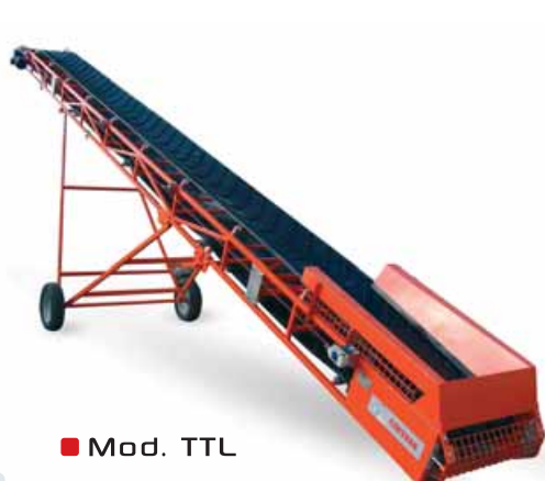
■ Mod. TTL