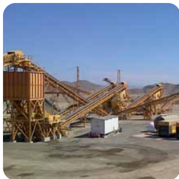
Aggregates | Egipto