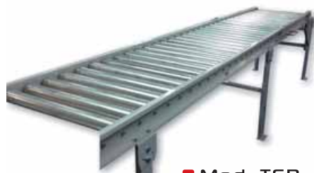
■ Mod. TCR