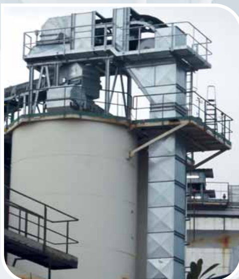
■ Mod. TEB