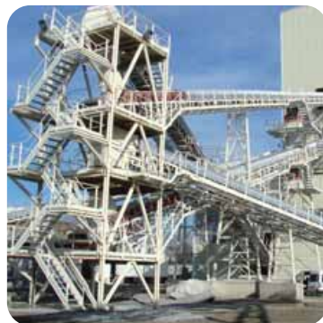
Gypsum | España