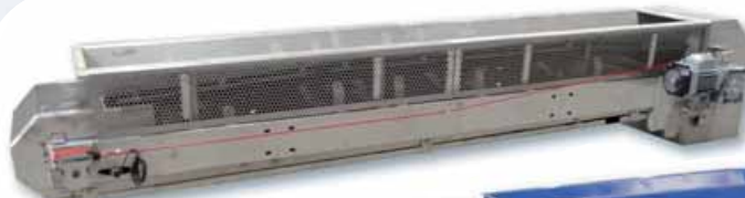
■ Mod. TUC