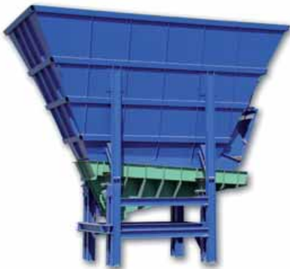
■ Mod. VIBRATING