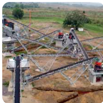
Quarry | Etiopía

Recognized company in the international market