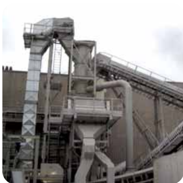
Metallurgy | Rusia