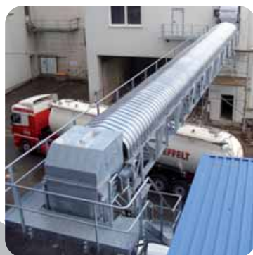
Industrial plant | Alemania