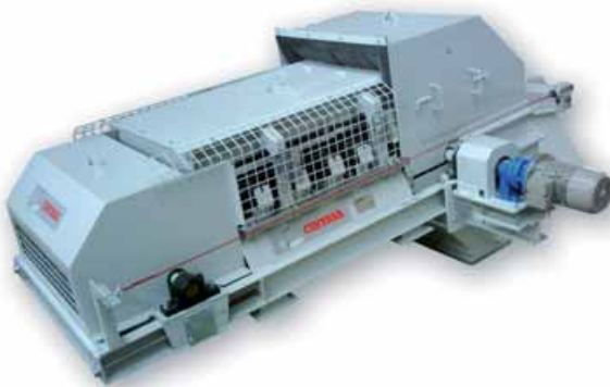
■ Mod. TUL-A