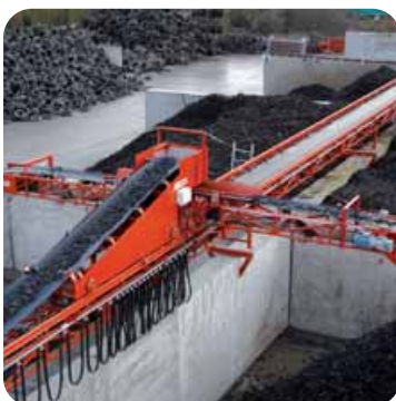
Recycling | Portugal