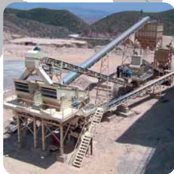
Quarry | Argelia