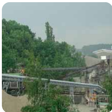
Concrete | Austria