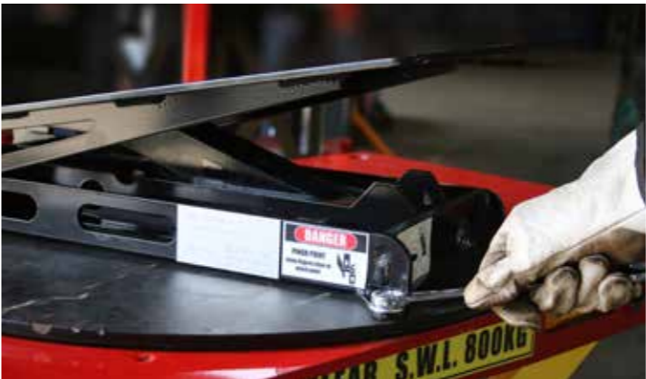
Table top attachments mount quickly and securely to the turntable with 4 x M12 bolts. The rotating turntable provides ease of movement when lining up components and bolt holes. (Pictured Above)

With the addition of smart attachments, TED® is the fitter's best friend. Remote controlled lifting and lowering of components can protect against personnel being in the line of fire during unplanned moves, lowering the risk of fatal and disabling crush injuries and offering considerable protection against all too common hand strip, pinch and crush injuries.